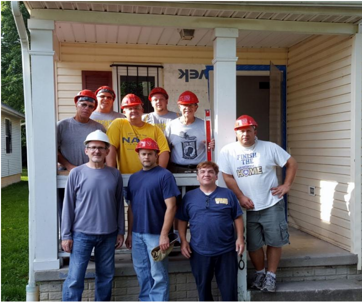
Knights from Council 14416 helping 'build' a house for Habitat for Humanity in 2016.