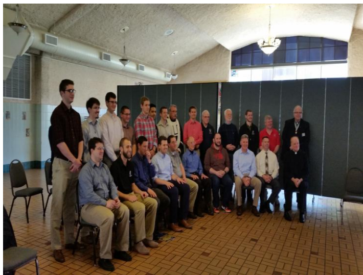
2nd Degree Exemplification - April 8, Wickliffe